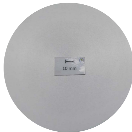
Macrosection, d178 mm: Segregation 3,1 mm

Depending on the process, a segregation zone occurs immediately in the marginalised layer of continuously cast billets. Prior to further processing these should be removed – this is already the case for the turned billets from Leichtmetall. Additionally these billets are also subjected to a final quality test by means of an automatic ultrasonic test underwater. In the case of casting lengths, the depth of the segregation zone is shown by way of example at 178 mm.