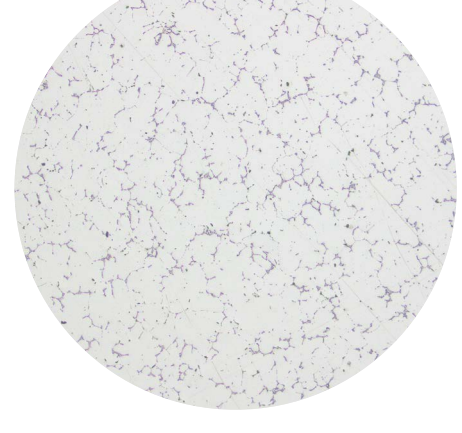
Macrosection, d178 mm; Segregation 2 mm